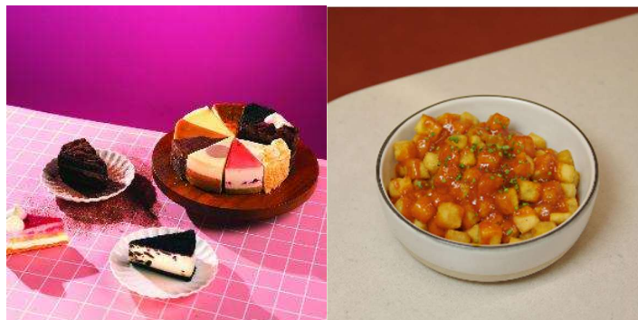
From left: Cakes from Cat & The Fiddle; Potato Cubes with Chili Crab Sauce from The Fat Sparrow

Show off your Singapore spirit by dressing in red, or presenting any red-coloured item, and get a spin at our special snack wheel at the B2 Customer Service Counter. Each spin will earn