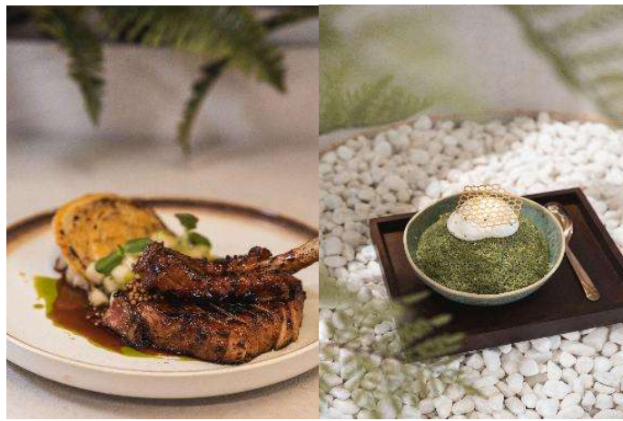
From left: The Fat Sparrow; Daydream Desserts

180 Kitchener Road, City Square Mall #B2-29, Singapore 208539 Tel: +65 6595 6565 | www.citysquaremall.com.sg