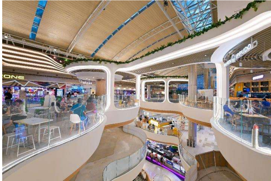
An overview of the new City Square Mall's Gastro Square on Level 4

From 25 July to 24 August , visitors can look forward to engaging activities and promotions that range from a festive food fair, the opening of several new-to-Singapore food concepts, special 60-cent coupon deals, to a special Chingay showcase to support its UNESCO nomination.