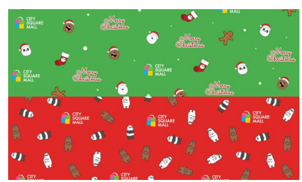
We Bare Bears Christmas wrappers (available in 2 designs)

15 Nov – 29 Nov: Grizz 30 Nov – 14 Dec: Panda 15 Dec – 29 Dec: Ice Bear