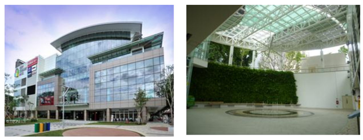
City Green (Level 1)

City Square Mall continues to offer City Green and Fountain Square to community interest groups